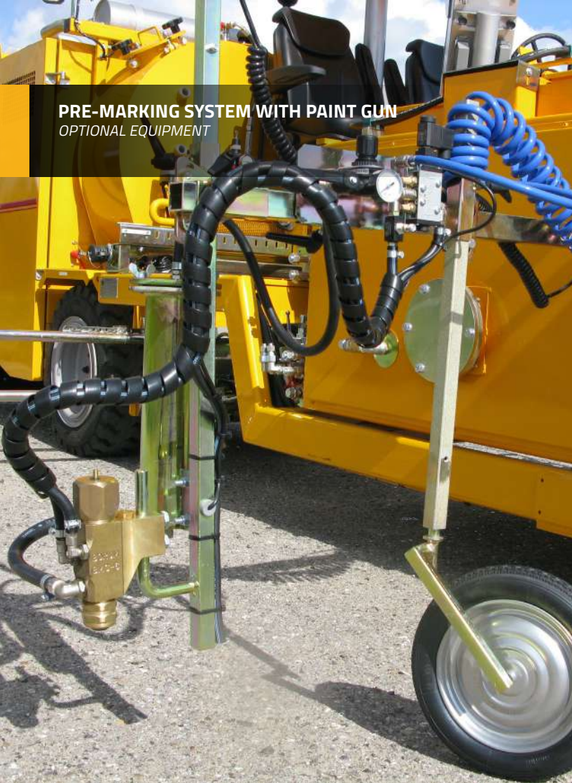
PRE-MARKING SYSTEM WITH PAINT GUN OPTIONAL EQUIPMENT