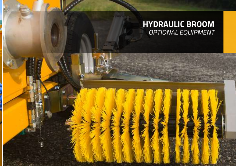
HYDRAULIC BROOM OPTIONAL EQUIPMENT