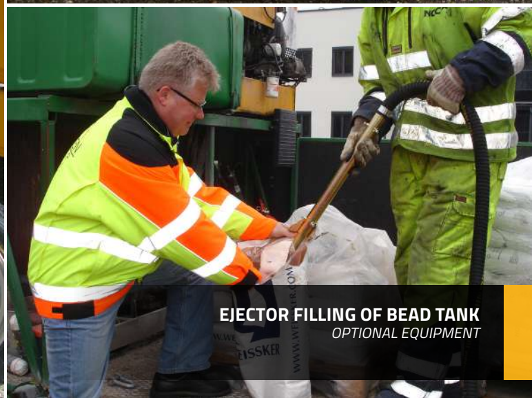
EJECTOR FILLING OF BEAD TANK OPTIONAL EQUIPMENT