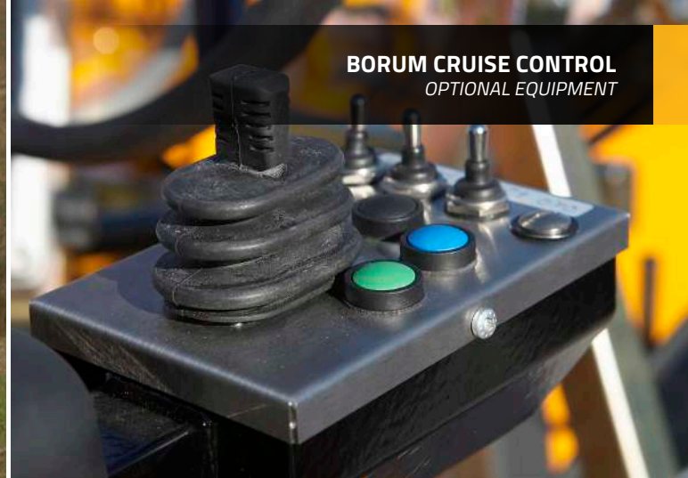
BORUM CRUISE CONTROL OPTIONAL EQUIPMENT