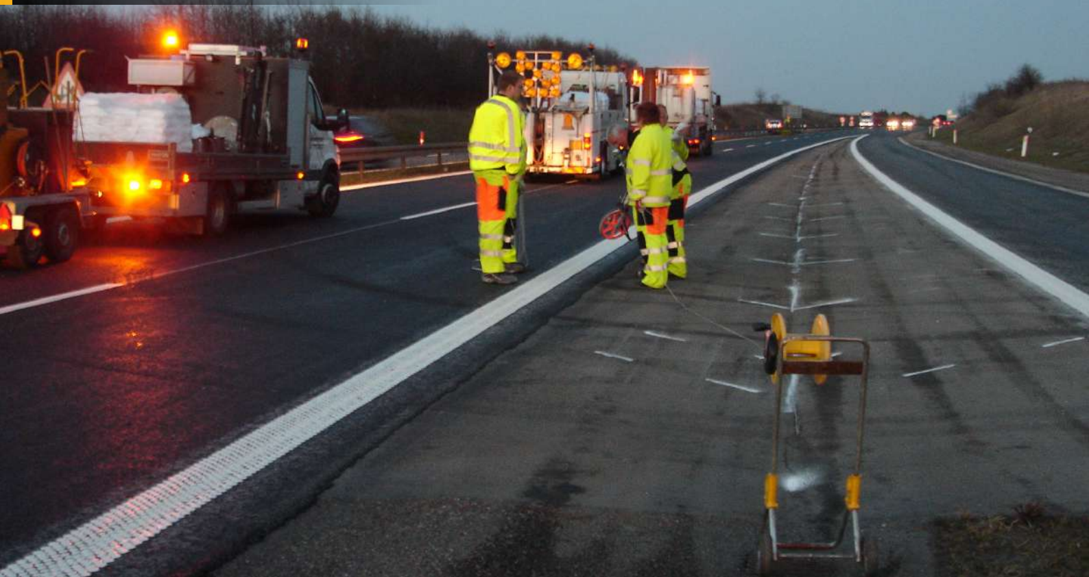
PHOTO MAY SHOW OPTIONAL EQUIPMENT