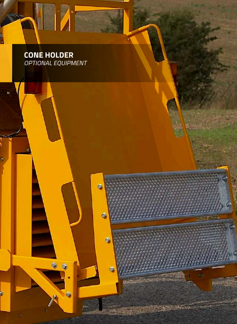
CONE HOLDER OPTIONAL EQUIPMENT