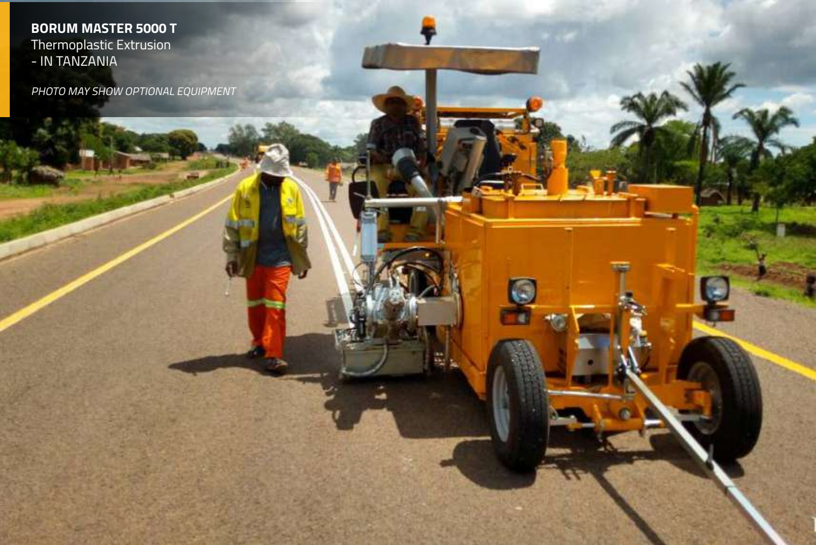
PHOTO MAY SHOW OPTIONAL EQUIPMENT