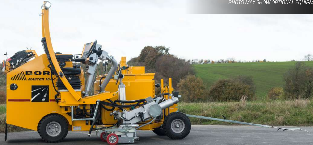
PHOTO MAY SHOW OPTIONAL EQUIPMENT