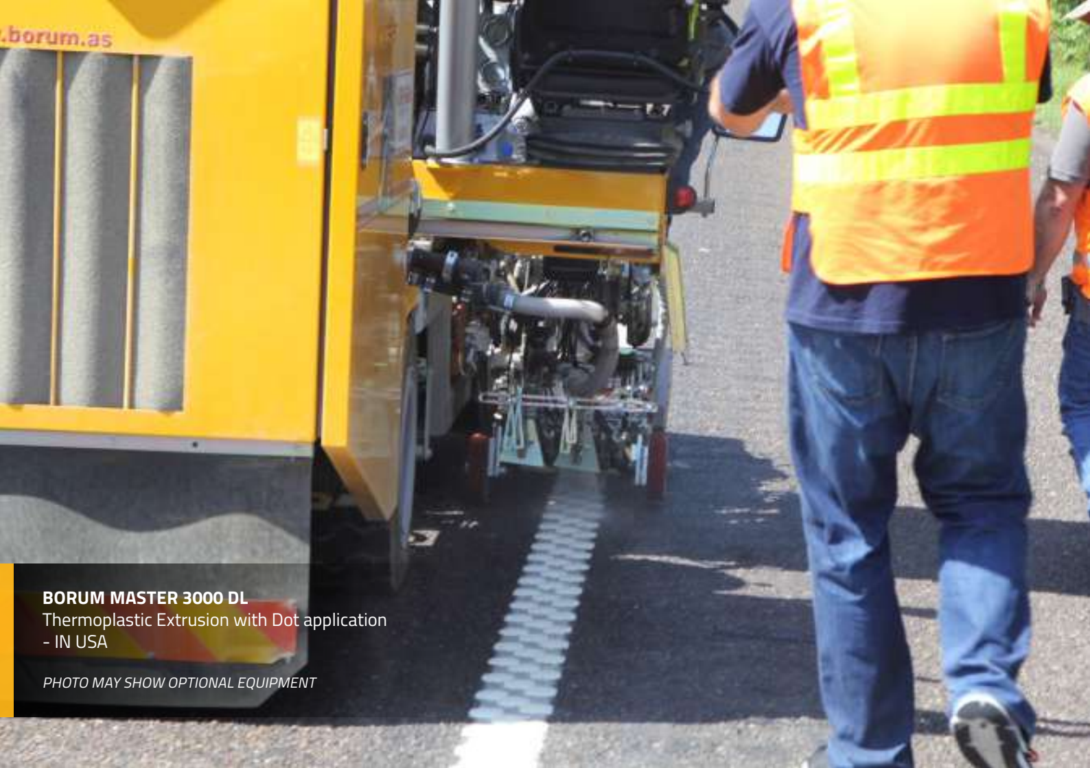
PHOTO MAY SHOW OPTIONAL EQUIPMENT

Thermoplastic Extrusion with Dot application - IN USA