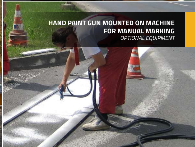
HAND PAINT GUN MOUNTED ON MACHINE FOR MANUAL MARKING OPTIONAL EQUIPMENT