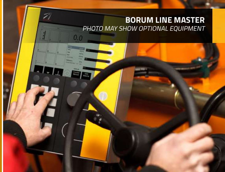
PHOTO MAY SHOW OPTIONAL EQUIPMENT