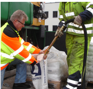
Ejector filling of bead tank