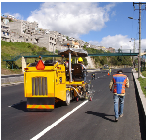
Remote control for BM LineMaster