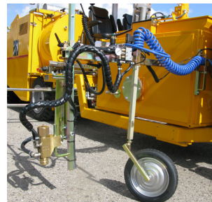
Pre-marking system with paint gun