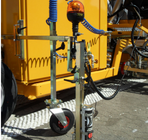
Pre-marking system with paint can

The additional equipment can be mounted on the machine according to your requirements. They are not necessary for the running of the machine, but add to the comfort of the machine driver or to the functionality of the machine.