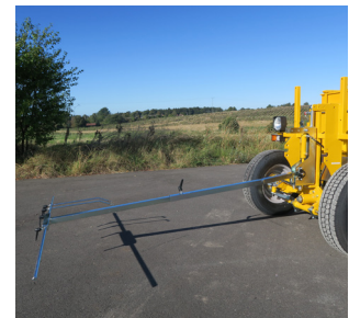
Pointer turning with steering With hydraulic lifting system