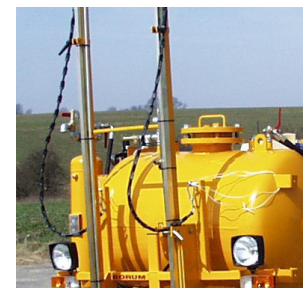
Fixed pointer With hydraulic lifting system