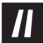
Basic Line (Continuous)

PHOTOS MAY SHOW OPTIONAL OR CUSTOMISED EQUIPMENT.