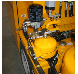
Air drier for bead tank