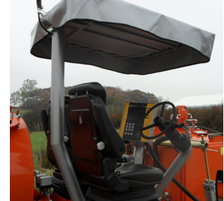
Sunshade with 1 rotating light