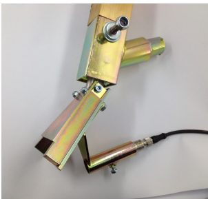
Bead alarm mounted on bead gun